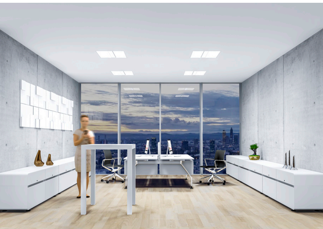
MELLOW LIGHT IV 1 channel